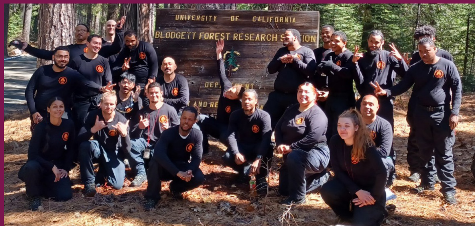
Blodgett Forest Research Station is owned by UC Berkeley who partnered with FFRP for Forestry Week